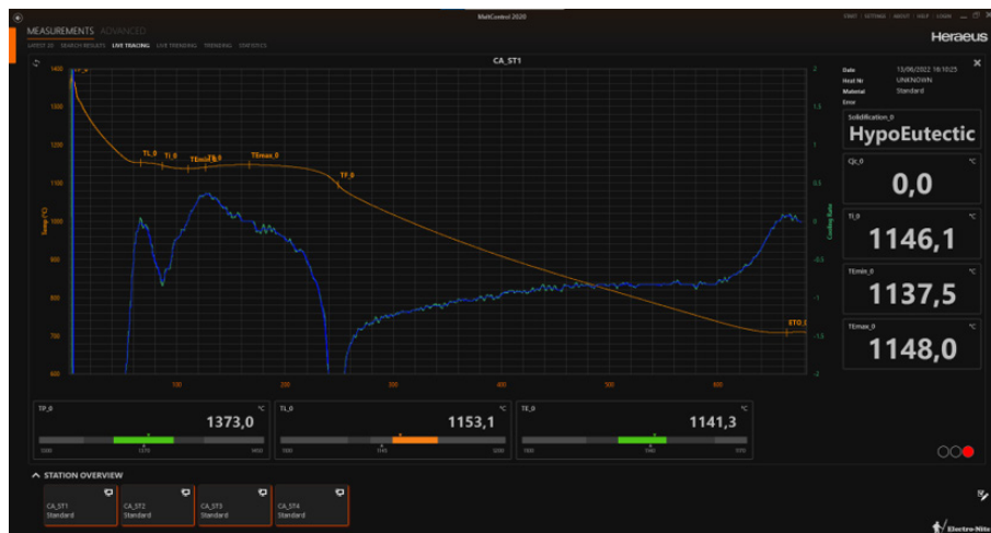
Live tracing view of measurement results