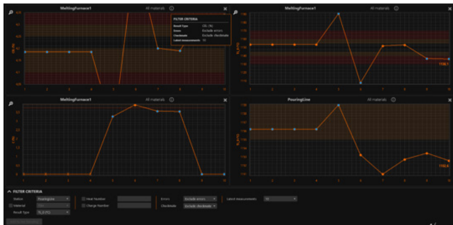
Trending window to trend a result type for the selected station and material. The trend will show the ranges of the different materials measured in that station.