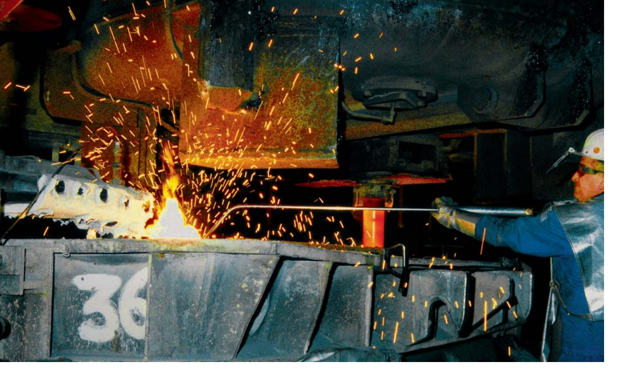
Bath temperature measurement in the tundish

enabling measuring cable length to be reduced to a minimum. The inclusion of large LED displays integrated into the equipment permit the instrument to be viewed from distances up to 30 metres.