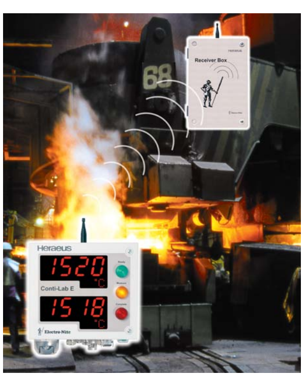
Conti-Lab E instrument variant with radio data transmission

The Conti-Lab E is fitted with customer oriented instrument interfaces. Two data interfaces and signal outputs are strategic components of the basic devices.