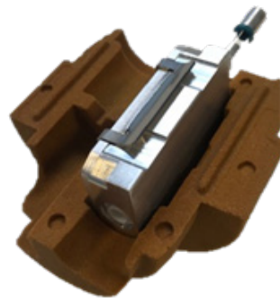
QuiK-Spec ® Sampler